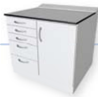
Brilliant 201/ 210/221/250