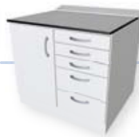
Jade 700/ Saphir