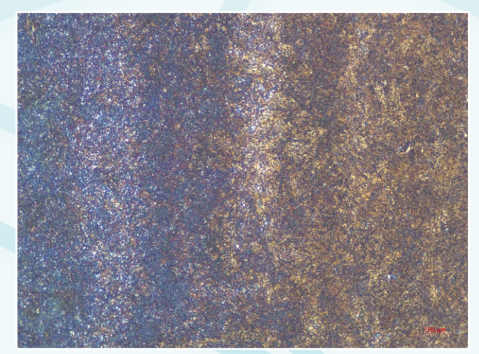
Etched with 3% Nital, BF, 100x