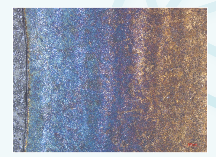
Etched with 3% Nital, BF, 50x