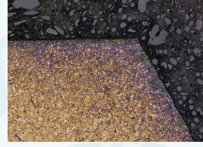
Etched with 3% Nital, BF, 200x