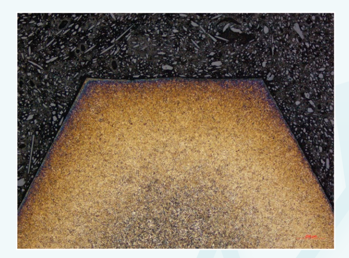
Etched with 3% Nital, BF, 50x