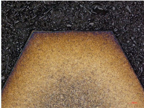
Etched with 3% Nital, BF, 50x